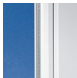
Classic design with soft contours