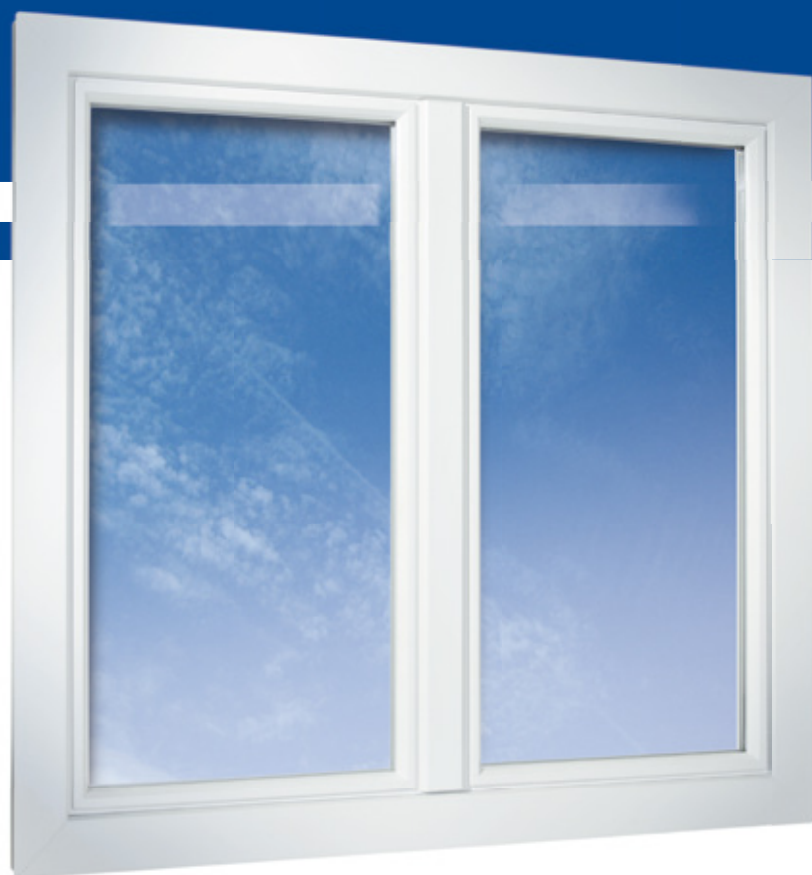
2-part-casement window, semi-recessed